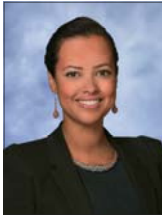
Aura Vasquez Commissioner